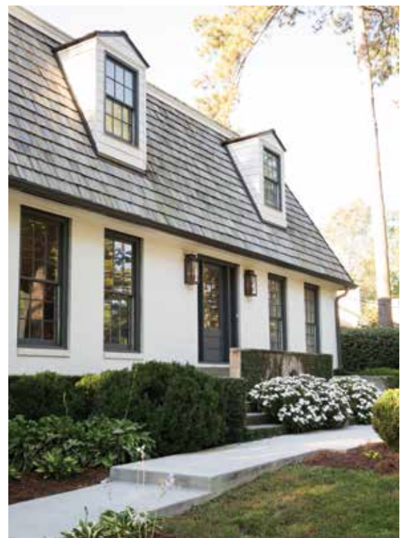
LEFT | French-inspired architecture was updated with custom white paint on exterior brick and a new cedar-shake roof with an extended roofline. Gas lanterns and simple landscaping add to the charm.