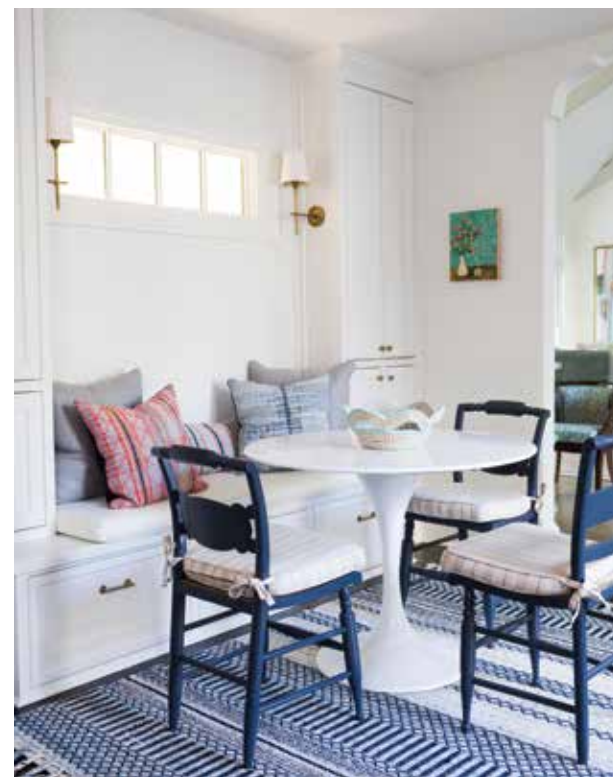
FAR LEFT | The multifunctional breakfast room has built-in seating and storage. "The breakfast chair hand-me-downs have been painted over four or five times," says Gregg. They're now wearing Benjamin Moore "Evening Dove." The rug is from Serena & Lily, and the wall-covering is Thibaut.