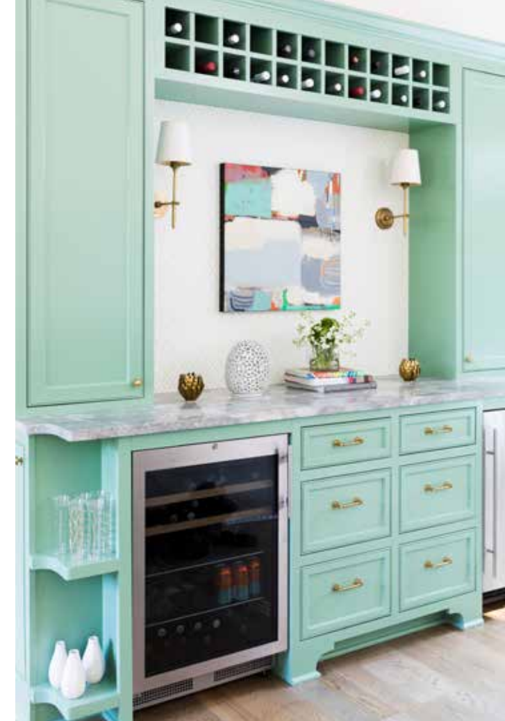
ABOVE | The festive bar area is painted in Benjamin Moore "Southfield Green."