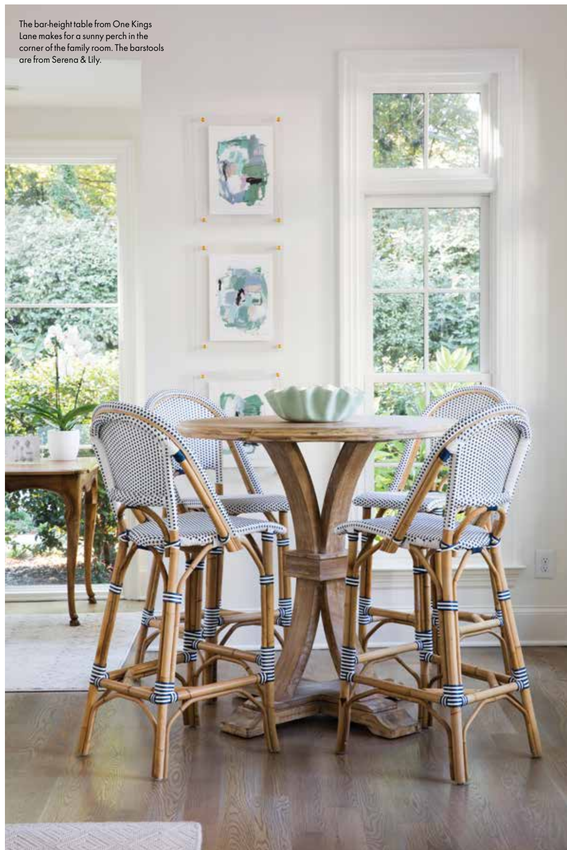
The bar-height table from One Kings Lane makes for a sunny perch in the corner of the family room. The barstools are from Serena & Lily.