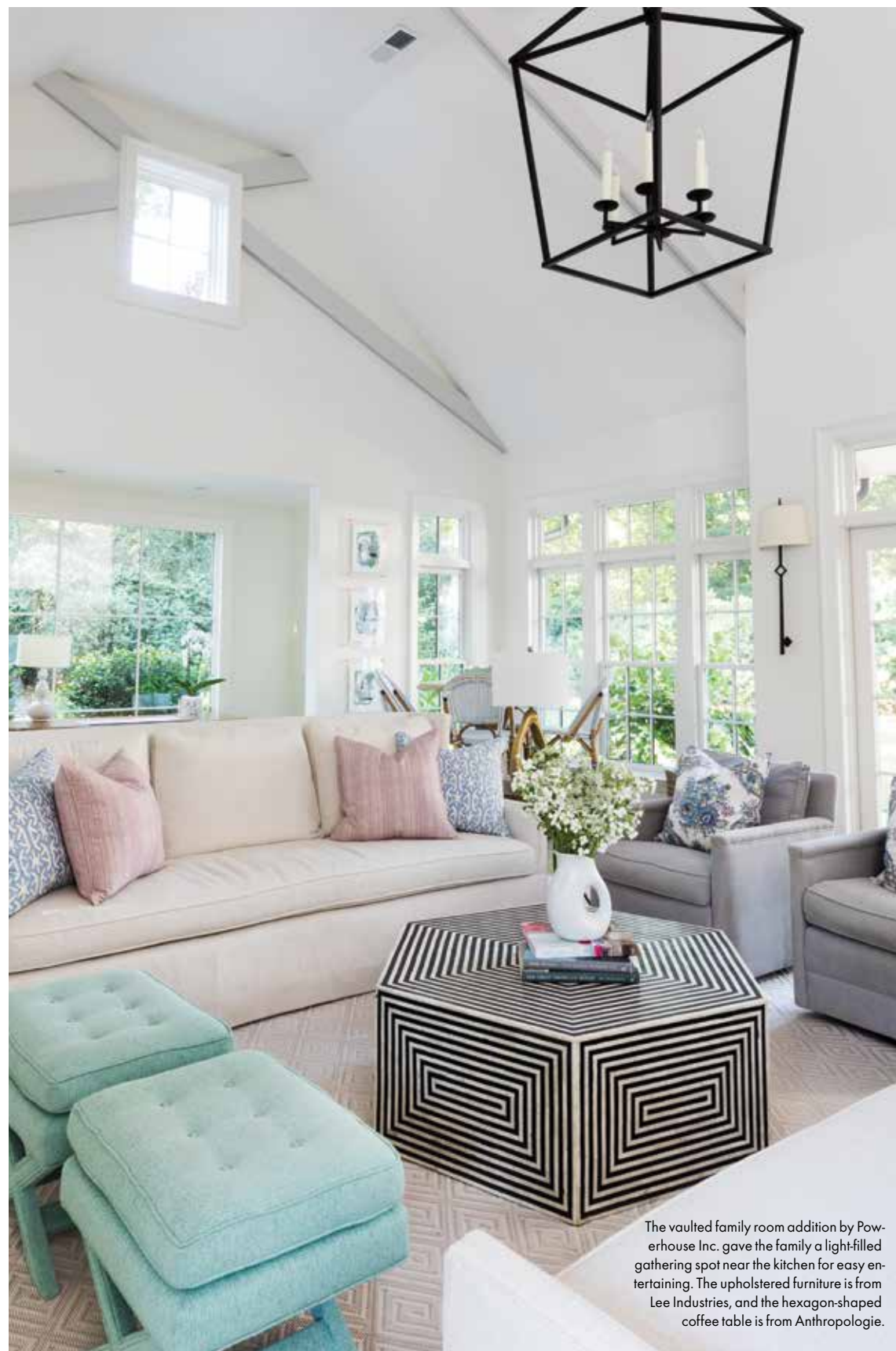
The vaulted family room addition by Powerhouse Inc. gave the family a light-filled gathering spot near the kitchen for easy entertaining. The upholstered furniture is from Lee Industries, and the hexagon-shaped coffee table is from Anthropologie.