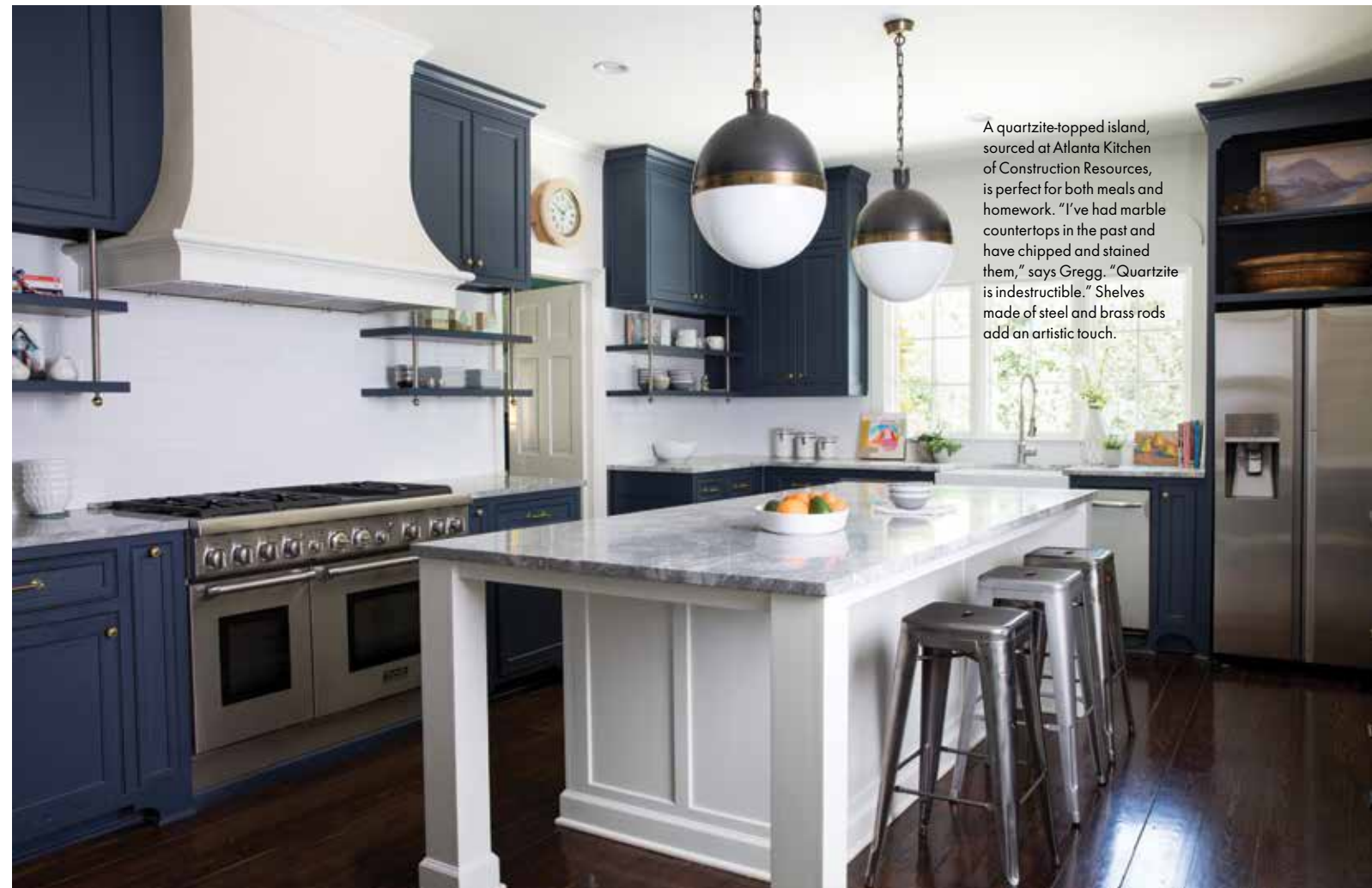
A quartzite-topped island, sourced at Atlanta Kitchen of Construction Resources, is perfect for both meals and homework. "I've had marble countertops in the past and have chipped and stained them," says Gregg. "Quartzite is indestructible." Shelves made of steel and brass rods add an artistic touch.