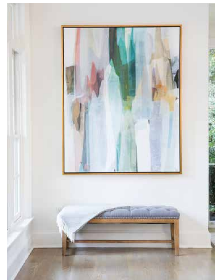
BELOW | An ethereal 48 x 60-inch mixed-media painting by Lynn Sanders.