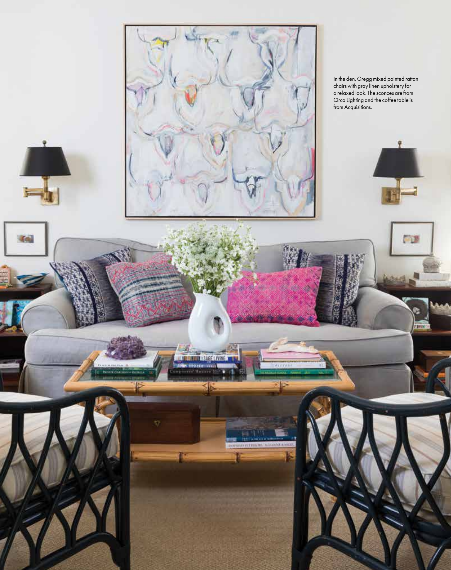
In the den, Gregg mixed painted rattan chairs with gray linen upholstery for a relaxed look. The sconces are from Circa Lighting and the coffee table is from Acquisitions.